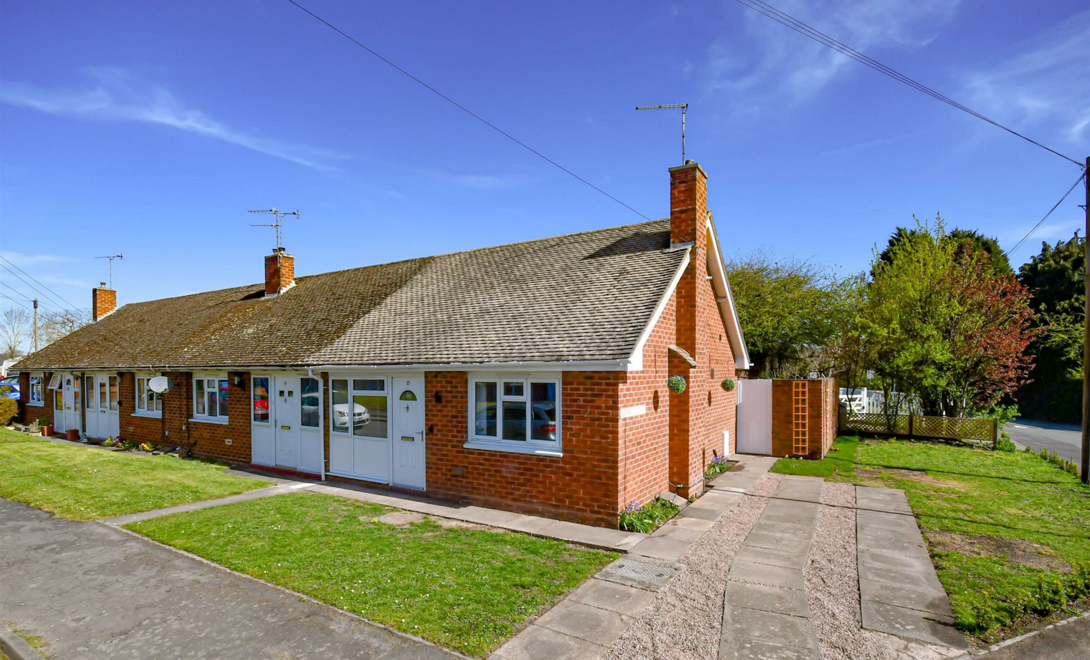
15 School Close, Trysull, Wolverhampton, WV5 7HS